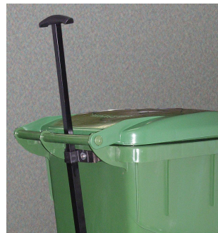
Extended Handle option for MGB60L