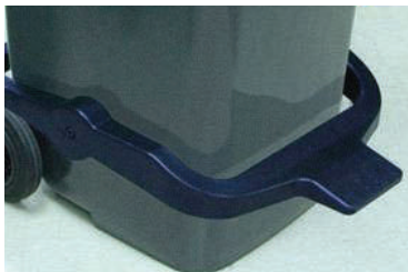
Plastic Foot Pedal Available for 60/80/120/240