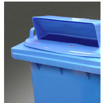
Recycling Lid option for MGB240L