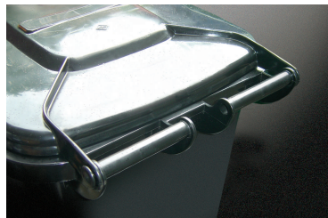
Twin Handle option